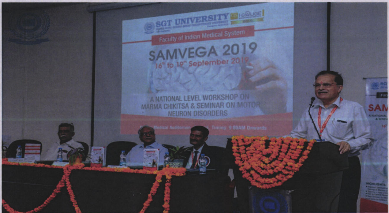
Guest Speaker taking his session during the workshop

Registrar SGT University, Budhera, Gurugram