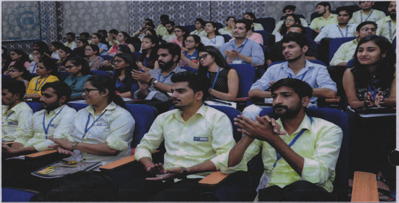
Participants of the SAMVEGA Programme

Budhera, Gurugram-Badli Road, Gurugram (Haryana) – 122505 Ph. : 0124-2278183, 2278184, 2278185